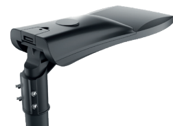
TYPE I TYPE III TYPE IV TYPE V