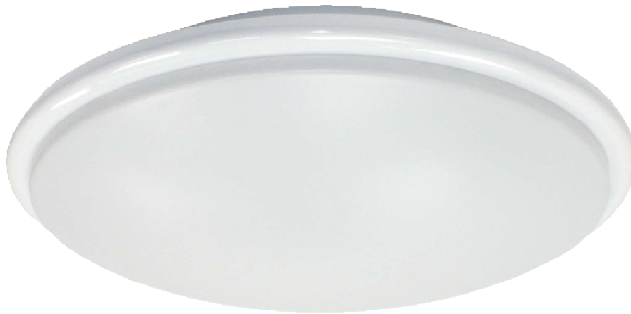
A general purpose surface LED luminaire ideal for circulation areas.