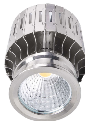
ILS 13W &amp; 18W

A competitive, interchangeable and architectural LED downlight system. An alternative light engine to an MR16 or GU10 lamp.