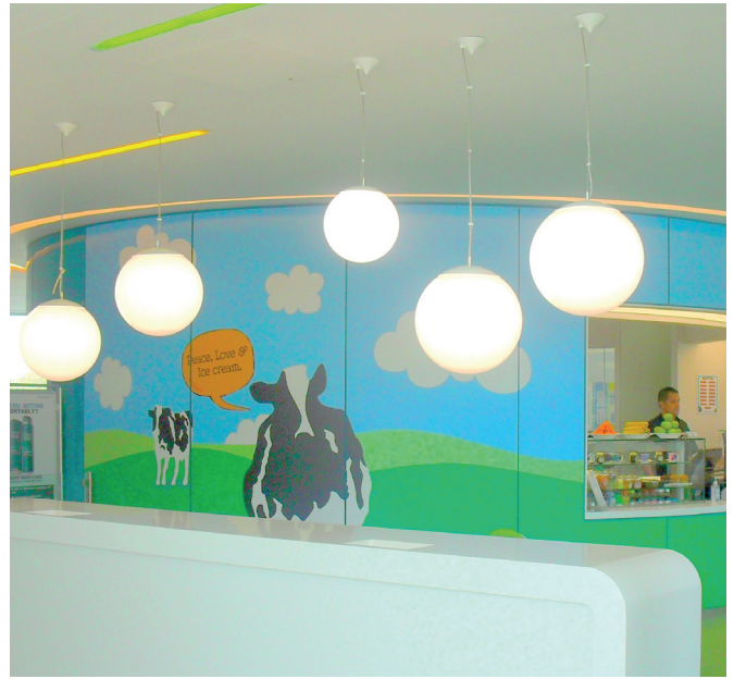
Ben and Jerry's Globe