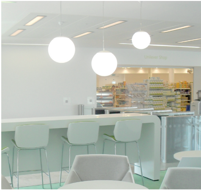
Ben and Jerry's